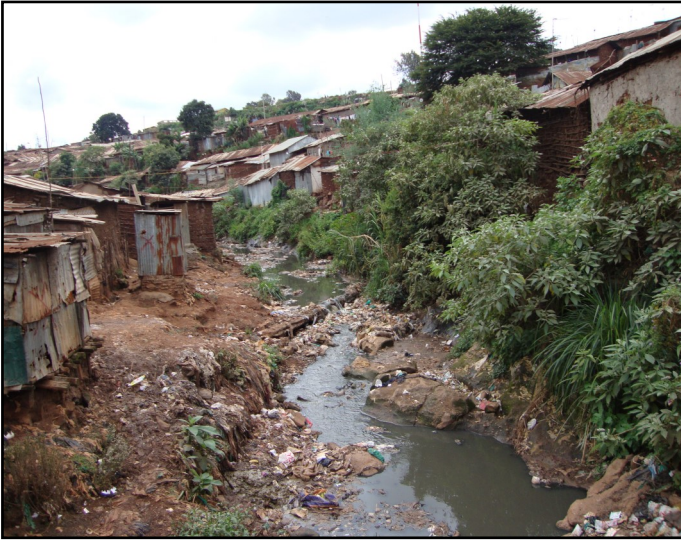
Inside the Kibera Slum, raw sewage flows freely

Visiting the Kibera Slum in Kenya is a privilege of a lifetime. Imagine a one square mile piece of land filled with hard orange dirt, tens of thousands of 10x10 mud shacks. These shacks are often home to 5 or more people with no running water or toilets. The people living here have to purchase drinking water and pay to use a public toilet that has limited open hours. If you are fortunate, you may have a mattress and one light bulb. They often have a piece of fabric covering the mud cut out doorway for privacy. I have visited these homes and it's a joy to meet these amazing families. They have the same needs, desires, and dreams that all of us have, they just have very little opportunity and financial resources. The only way a child can attend school is if they are individually sponsored through