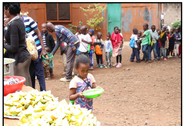
Activity day from the Bible Clubs gathering

On one particular trip, we had the opportunity to gather 650 of the children from the Bible Clubs for a day of worship, games, lunch, and other activities. I had the privilege of standing at the front of the food line to personally meet each child and give them a piece of bread. "I'll never forget that day, it's imprinted on my mind forever!" One little boy, around 6-7 years old looked at me with his big brown eyes and held up two fingers. He was asking for two pieces of bread. It broke my heart to tell him "no" because I could only give him one slice or others would go without. I actually wanted to hand him the whole loaf!! Can you imagine telling your hungry child or grandchild they could only have one piece of bread? It's unfathomable to us.