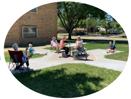
Social Distance Lunching!

We are "sew" grateful that we are able to continue our mission of providing memory quilts for grieving families, purposeful community for our volunteers and meet the spiritual and physical needs of the children who attend the Bible Clubs in the Kibera Slum.