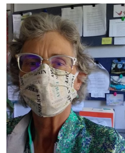
First day back with my homemade facemask.

Did you know elastic was a hot commodity during Shelter at Home? It was virtually impossible to find, yet it is a necessary ingredient to making a face mask. We had two times when elastic was delivered on the very day that we ran out! Isn't that amazing? Proof that God cares about the tiniest details of our lives!