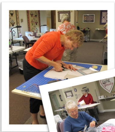
Volunteers begin prepping the clothing to make it part of the quilt design.

Volunteers Use God Given Talents to Help Others