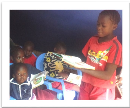
The brand new children’s Bibles inspire the children to love God’s Word.

Memory Quilt Recipients Receive Comfort; Volunteers Have Purpose & Destitute Children Hear God’s Word