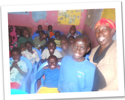
Bible Club students love their new chairs purchased with memory quilt donations.