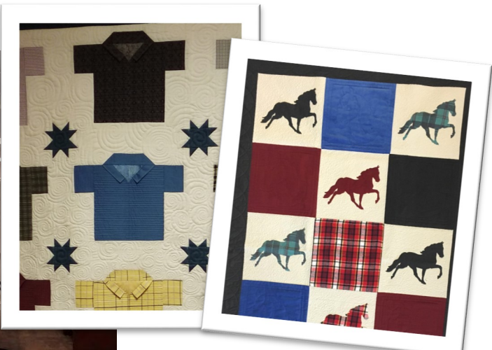
Because of you we can create personalized memory quilts for people with hurting hearts. Having the comfort of a quilt made with their loved one’s clothing to honor their life story is priceless!