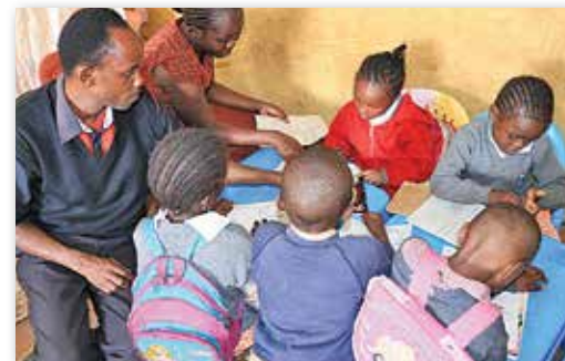
500 children have received increased food rations through quilt recipient donations!

Because of your support volunteers can come to Living Threads and create beautiful memories with quilts, pillows and wall hangings. When families receive their quilts they make a donation for the volunteer labor that went into making their quilts. 100% of the donation for volunteer labor goes to the children living in the Kibera slum in Nairobi, Kenya. Just consider what God has done: